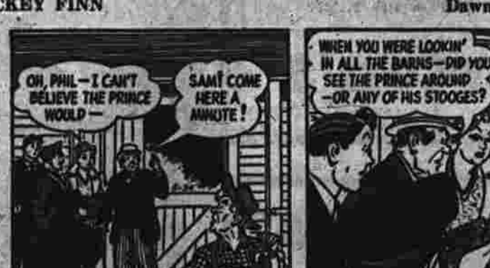
MICKY FINN BY LANK LEONARD