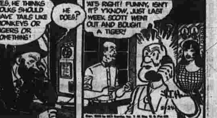
KEN WINSTON BY JERRY SIEGEL AND MIKE ROY