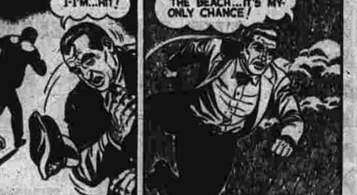
MICKY FINN BY LANK LEONARD