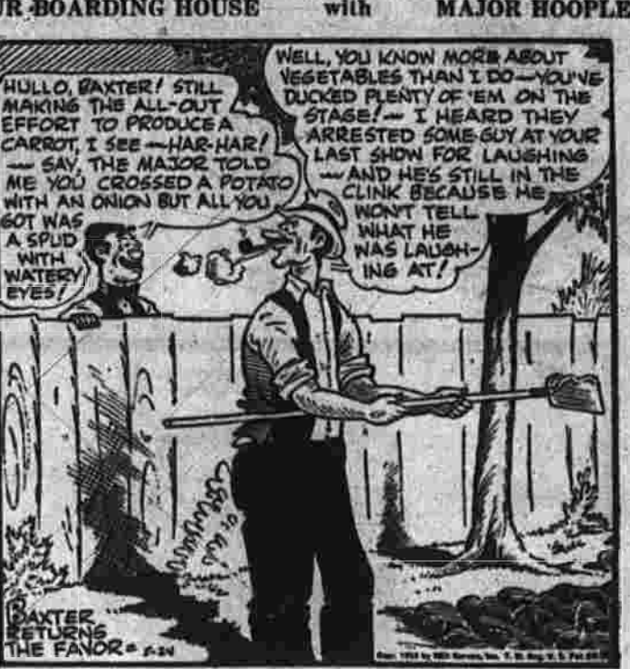
OUR BOARDING HOUSE BY EDGAR MARTIN