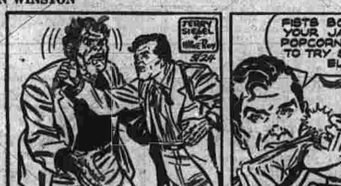
KEN WINSTON BY JERRY SIEGEL AND MIKE ROY